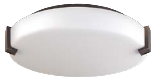
16" CEILING LIGHT STX-CL6-16DB QUICK SHIP