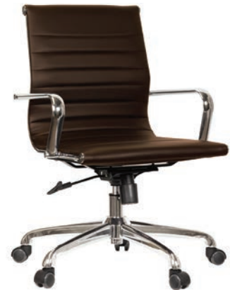
FERRARA TASK CHAIR STXC615BRW-ALUM Brown QUICK SHIP