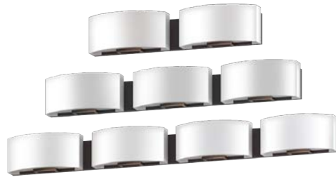
VANITY LIGHT STX-BV4-24DB 24" STX-BV4-37DB 37" STX-BV4-50DB 50" QUICK SHIP