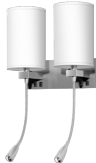
DOUBLE WALL SCONCE CL-WD2-LED QUICK SHIP