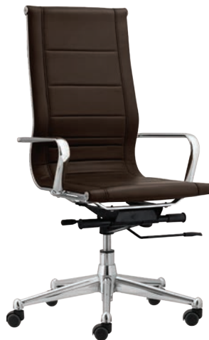
FLORENCE HIGH BACK TASK CHAIR STXC689BRW-ALUM Brown QUICK SHIP