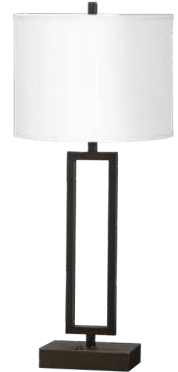
28" TABLE LAMP CL-ET-1 QUICK SHIP