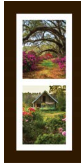
REGIONAL ARTWORK 13" W x 26" H Above desk SPECIAL ORDER