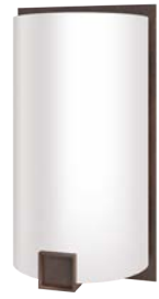
12" WALL SCONCE STX-SC15-12DB QUICK SHIP