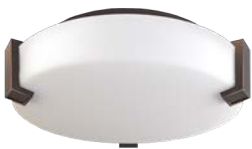
12" CEILING LIGHT STX-CL6-12DB QUICK SHIP