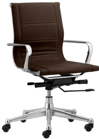
FLORENCE MID BACK TASK CHAIR STXC685BRW-ALUM Brown QUICK SHIP