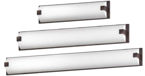
VANITY LIGHT STX-BV1-26DB 26" STX-BV1-38DB 38" STX-BV1-50DB 50" QUICK SHIP