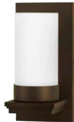
9" ENTRY SCONCE CL-ES-3 QUICK SHIP