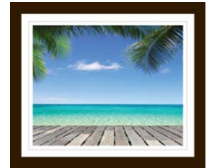
REGIONAL ARTWORK 13" W x 11" H Guest bath SPECIAL ORDER