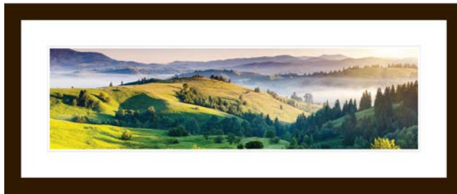
REGIONAL ARTWORK 48" W x 20" H Above sofa SPECIAL ORDER