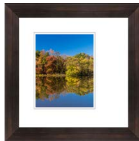
REGIONAL ARTWORK 19" W x 19" H Right Above sofa SPECIAL ORDER