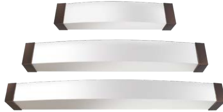
VANITY LIGHT STX-BV3-25DB 25" STX-BV3-37DB 37" STX-BV3-49DB 49" QUICK SHIP