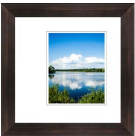
REGIONAL ARTWORK 19" W x 19" H Left Above sofa SPECIAL ORDER