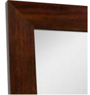
TEAK MIRROR M-C-VA3036 30" W x 36" H M-C-VA3646 36" W x 46" H M-C-VA3650 36" W x 50" H QUICK SHIP