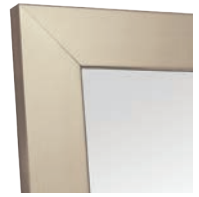
CHAMPAGNE STAINLESS MIRROR M-C-FL 30" W x 72" H QUICK SHIP