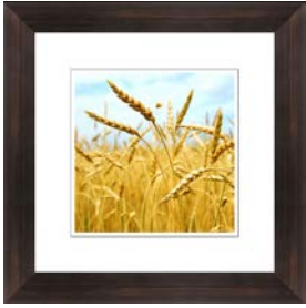
REGIONAL ARTWORK 19" W x 19" H Outer bath wall SPECIAL ORDER