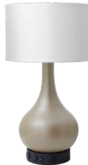
26" DESK LAMP CL-DS-1 CL-DS-1-USB QUICK SHIP