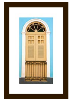
REGIONAL ARTWORK 24" W x 36" H Above luggage bench SPECIAL ORDER