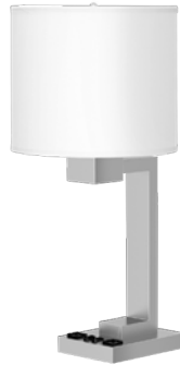
26" TWIN TABLE LAMP CL-TT-OPT CL-TT-USB QUICK SHIP