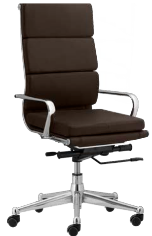
MADRID HIGH BACK TASK CHAIR STXC759-BRW Brown QUICK SHIP